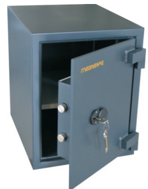
MK50 with Key Lock Kaba-Mauer