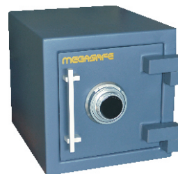
MK30 with Mechanical Combination Lock