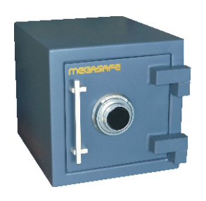
MK30 with Mechanical Combination Lock