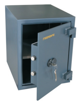
MK50 with Key Lock Kaba-Mauer